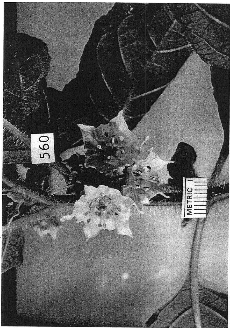
Figure 1. Jaltomata lojæ . Inflorescence on plant grown from seed of the type collection. Units are millimeters.